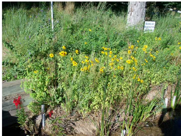
Wildflowers in several different colors, grasses and sedges are part of this shoreland restoration planted in 2008 and 2009.

We'll be creating and distributing a list of reputable local companies that sell native plants, and companies that assist with shoreline restoration projects.