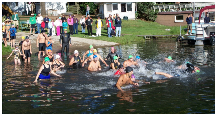
Swimmers start their Cloverleaf Lakes Triathlon in Pine Lake.