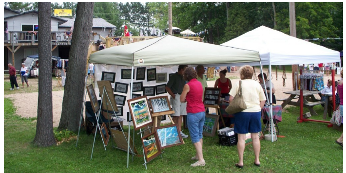
Spectators check out some of the paintings and photography at the Cloverleaf's Art by the Lake event.